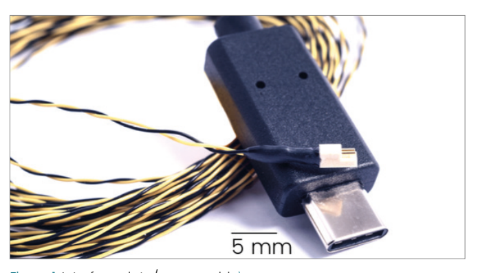
Figure 1: Interface data/power cable<sup>1</sup>

The Neuropixels PXIe control system is a plug & play interface system developed for the Neuropixels neural probes. It can be used in combination with all the Neuropixels probe variants. It connects to the probe and headstage through custom 5 m-long, flexible twisted-pair cables. Up to four cables can connect to a dedicated, modular PXIe data acquisition card, and multiple modules can be synchronized to enable recording from more than 4 headstages simultaneously.